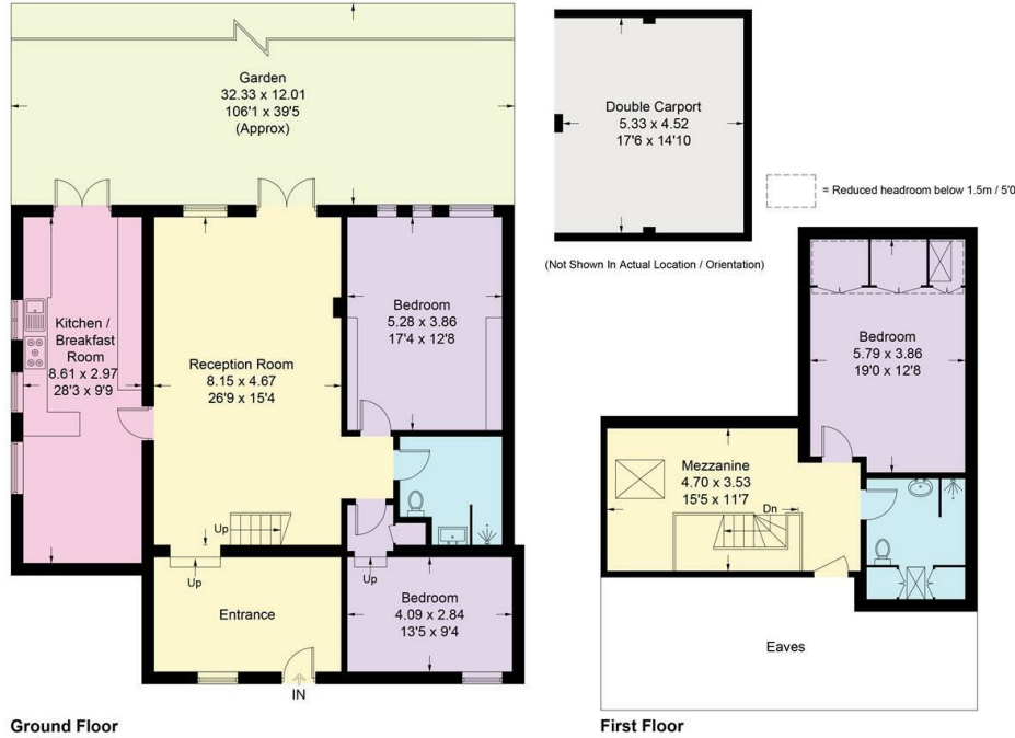
Illustration for identification purposes only, measurements are approximate, not to scale. floorplansUsketch.com © (ID1095337)